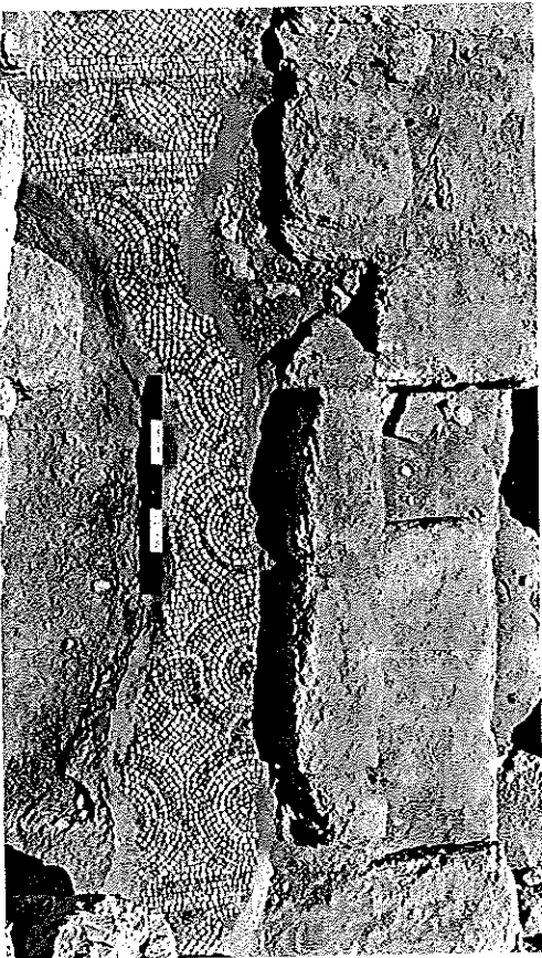
B. Fragment of the multicolored mosaic floor of the Byzantine church in Square A5.